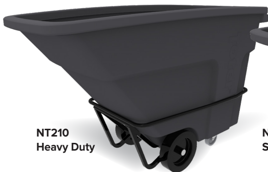
NT210 Heavy Duty

Inset Wheels (nestable fully assembled): Allows for easy storage