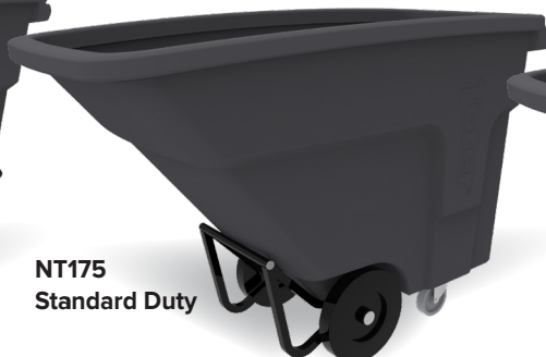
NT175 Standard Duty