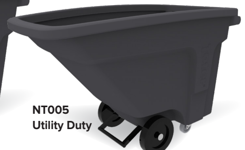
NT005 Utility Duty