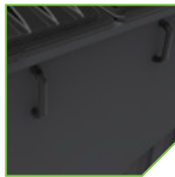
Optional comfort & grip handles for easy maneuverability