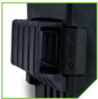
Replaceable, double-walled lift pockets for easy maintenance