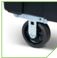
Replaceable double-walled bumpers for long-lasting durability