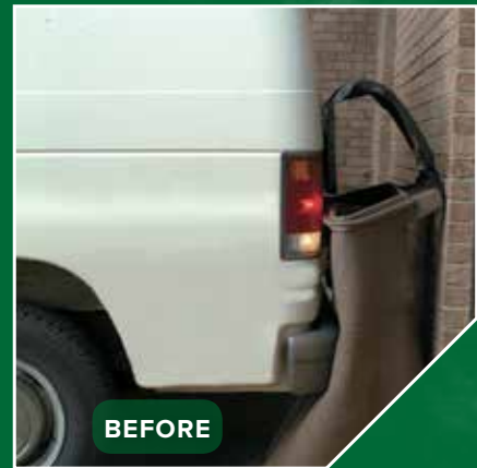
Toter carts are extremely impact-resistant – they flex, but don't break.