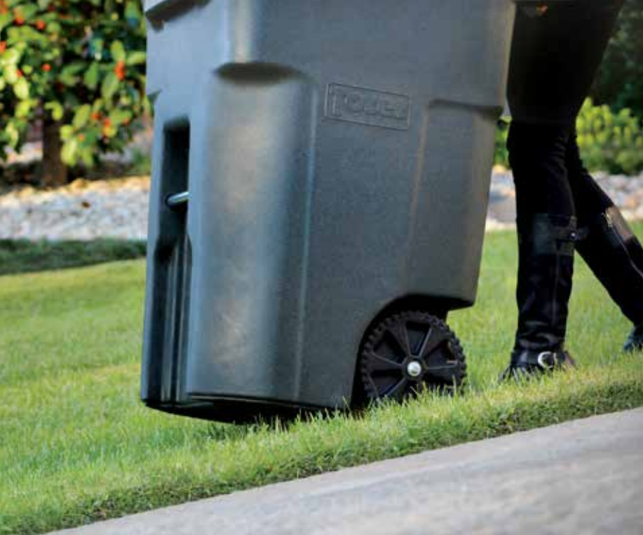
Toter carts are easy to tilt and roll to the curb.