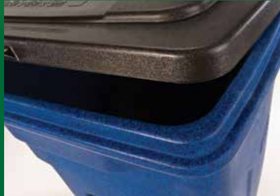
Only Toter carts have a Rugged Rim® to extend the life of the cart.