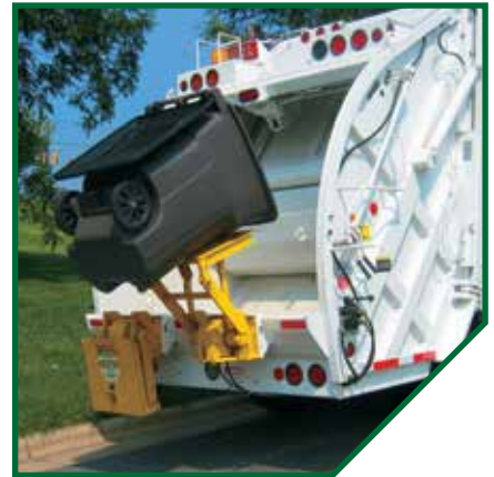
Toter carts are compatible with both fully automated arms (left) and semi-automated lifters (right).